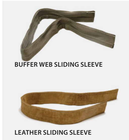
BUFFER WEB SLIDING SLEEVE