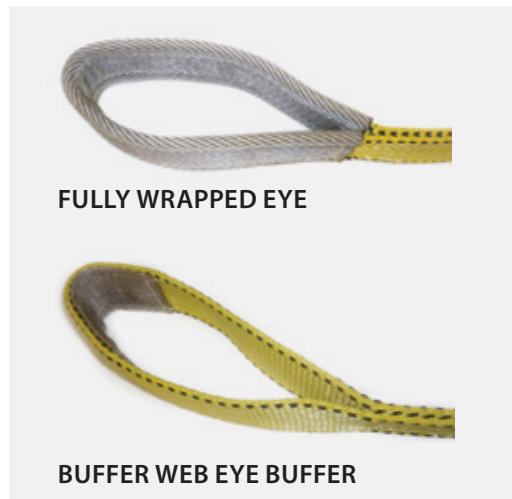
FULLY WRAPPED EYE