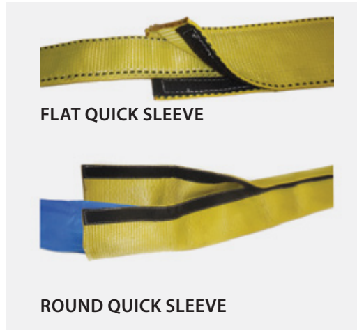
FLAT QUICK SLEEVE