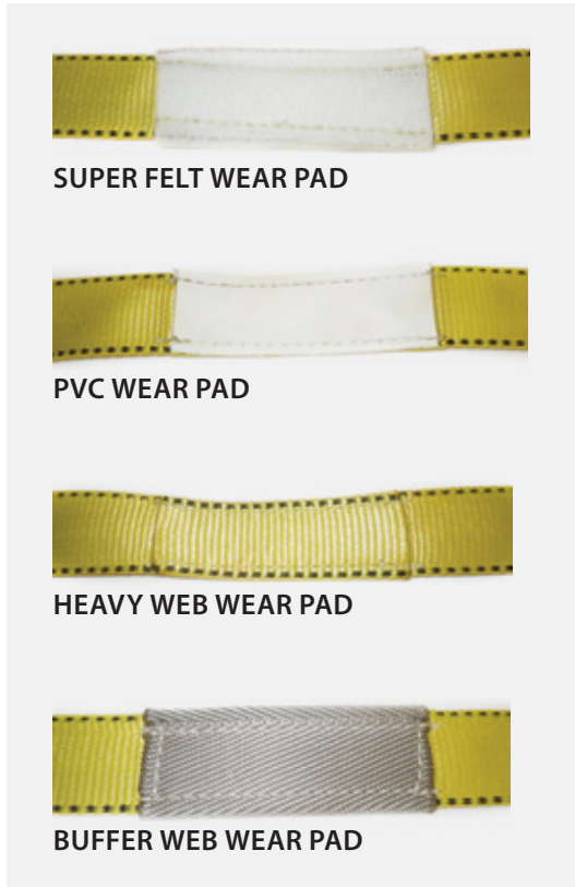
SUPER FELT WEAR PAD

* NOTE: Unless specifically indicated on tags, Wear Pads and Sleeves do not provide cut protection — see Pro-Corner® Page 51