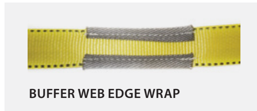
BUFFER WEB EDGE WRAP